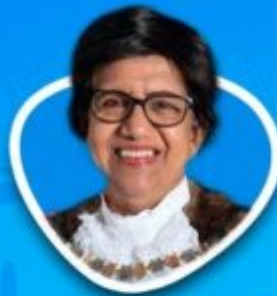
Cllr. Nagus Narenthira The Worshipful Mayor of Barnet