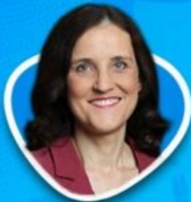
Rt. Hon. Theresa Villiers MP Member of Parliament for Chipping Barnet Vice Chair of the All Party Parliamentary Group for Tamils